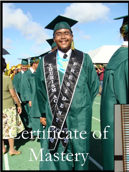
Certificate of Mastery